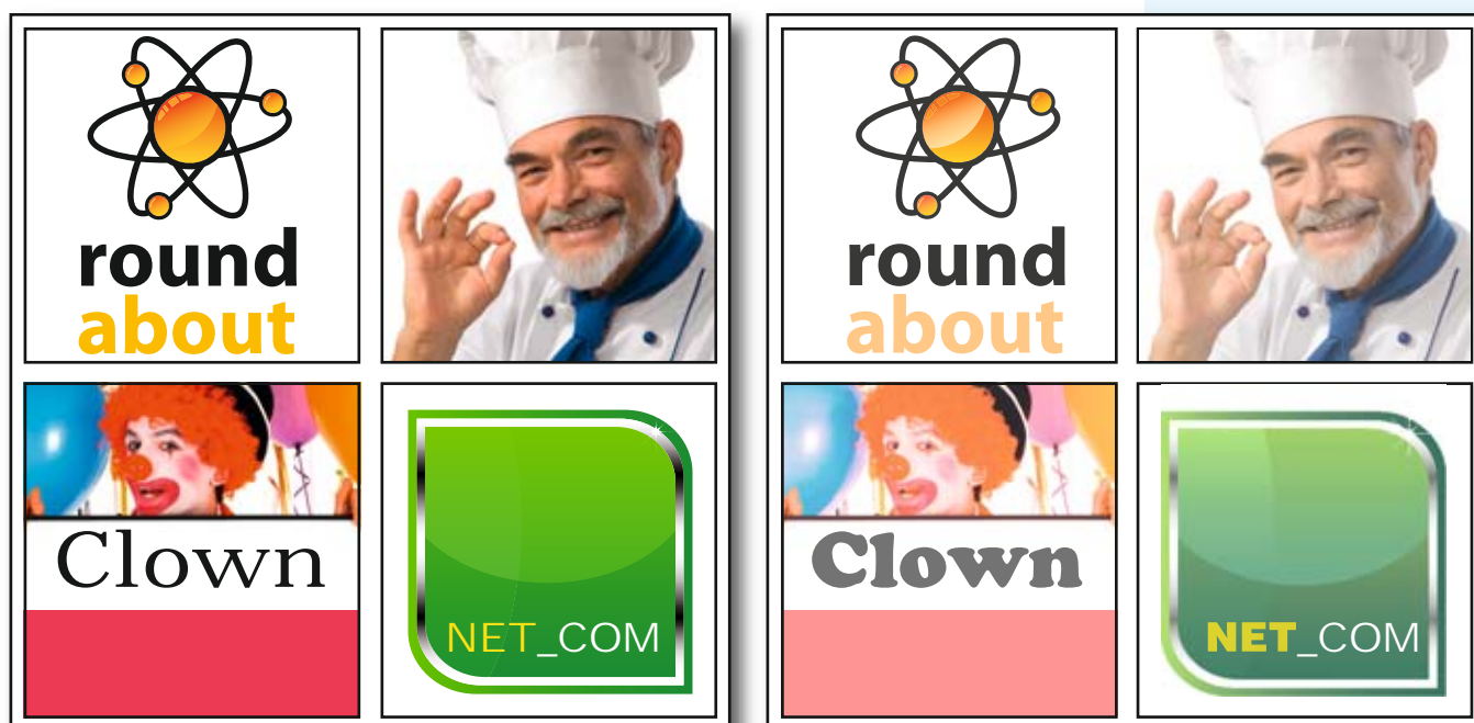
A decisive factor for contract partners is the ability to depict corporate logos and images with utterly faithful colour reproduction