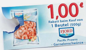
MH 1484 CCB – Coupon with security feature (tinted base paper)

The coated inkjet papers from, IPIA Member, Mitsubishi HiTec Paper can do just that, with a special ink receiving coating for the best colour brilliance, efficiency and rapid speed. Mitsubishi HiTec Paper offers JETSCRIPT worldwide: a broad range of coated inkjet papers for high-speed inkjet printing, for all applications, such as transaction and transpromo, direct mail & envelopes, publishing and security, on all modern inkjet systems, and now also with security features if required.